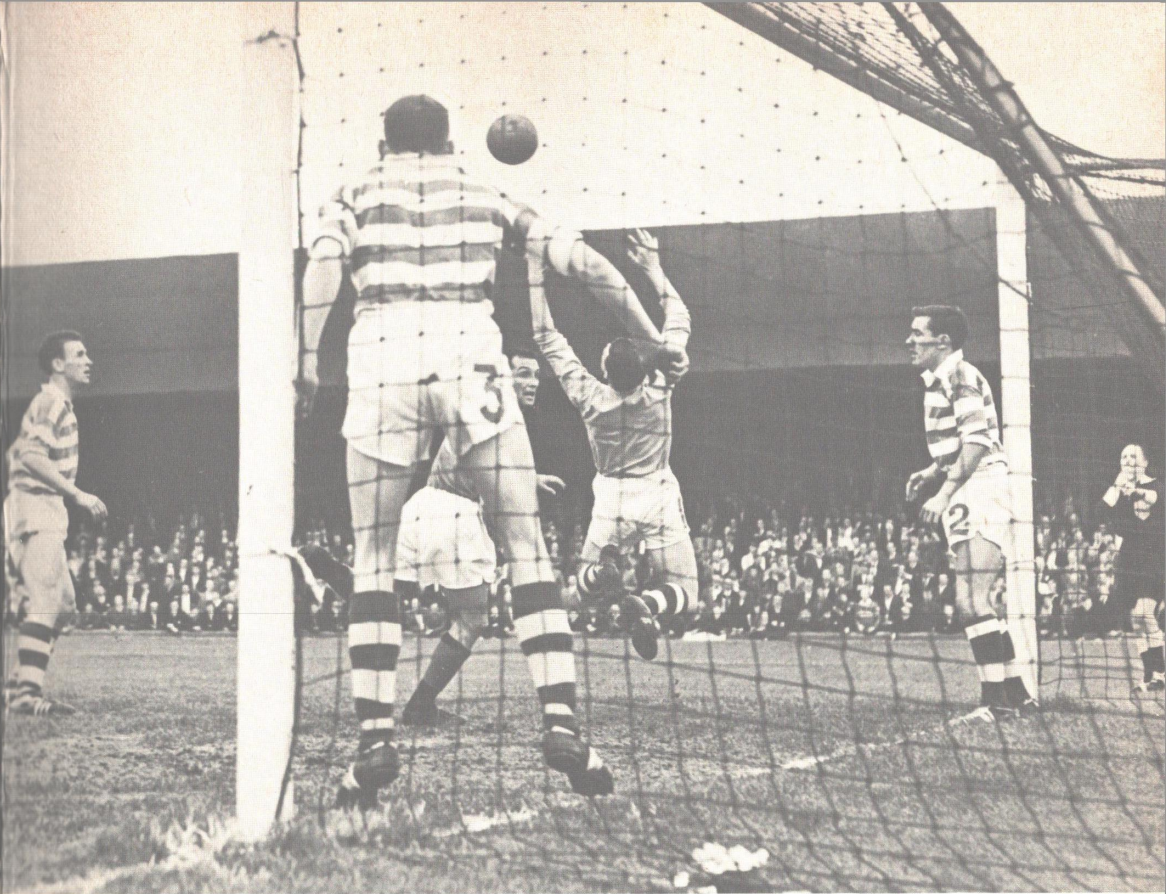
Hot action in the Celtic goal as Rangers' Ralph Brand challenges