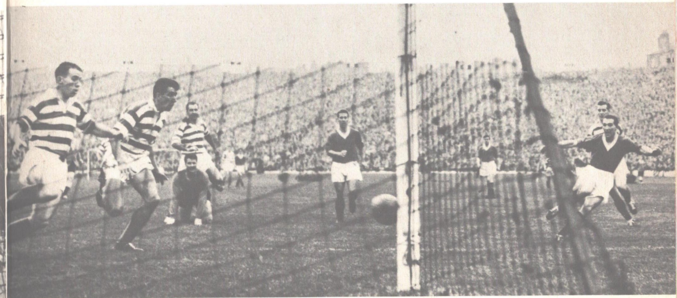
All the excitement as Brand shoots home for Rangers in a game with Kilmarnock