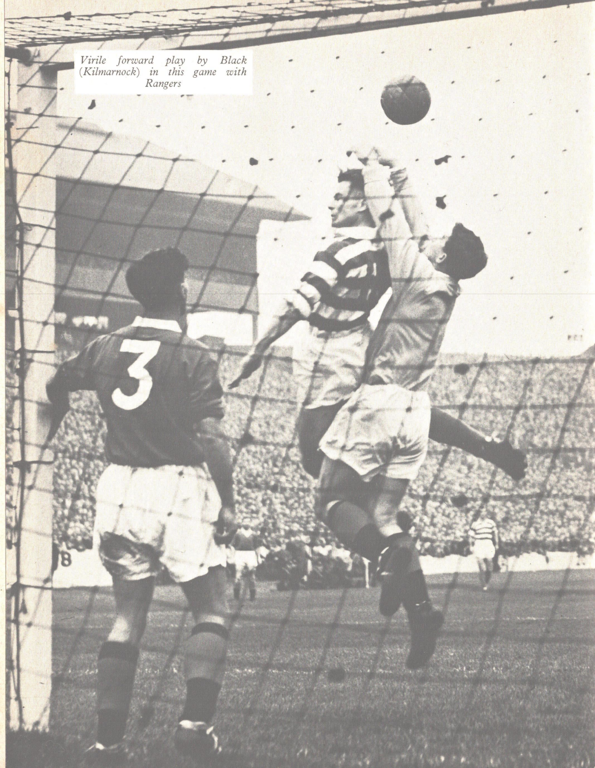
Virile forward play by Black (Kilmarnock) in this game with Rangers