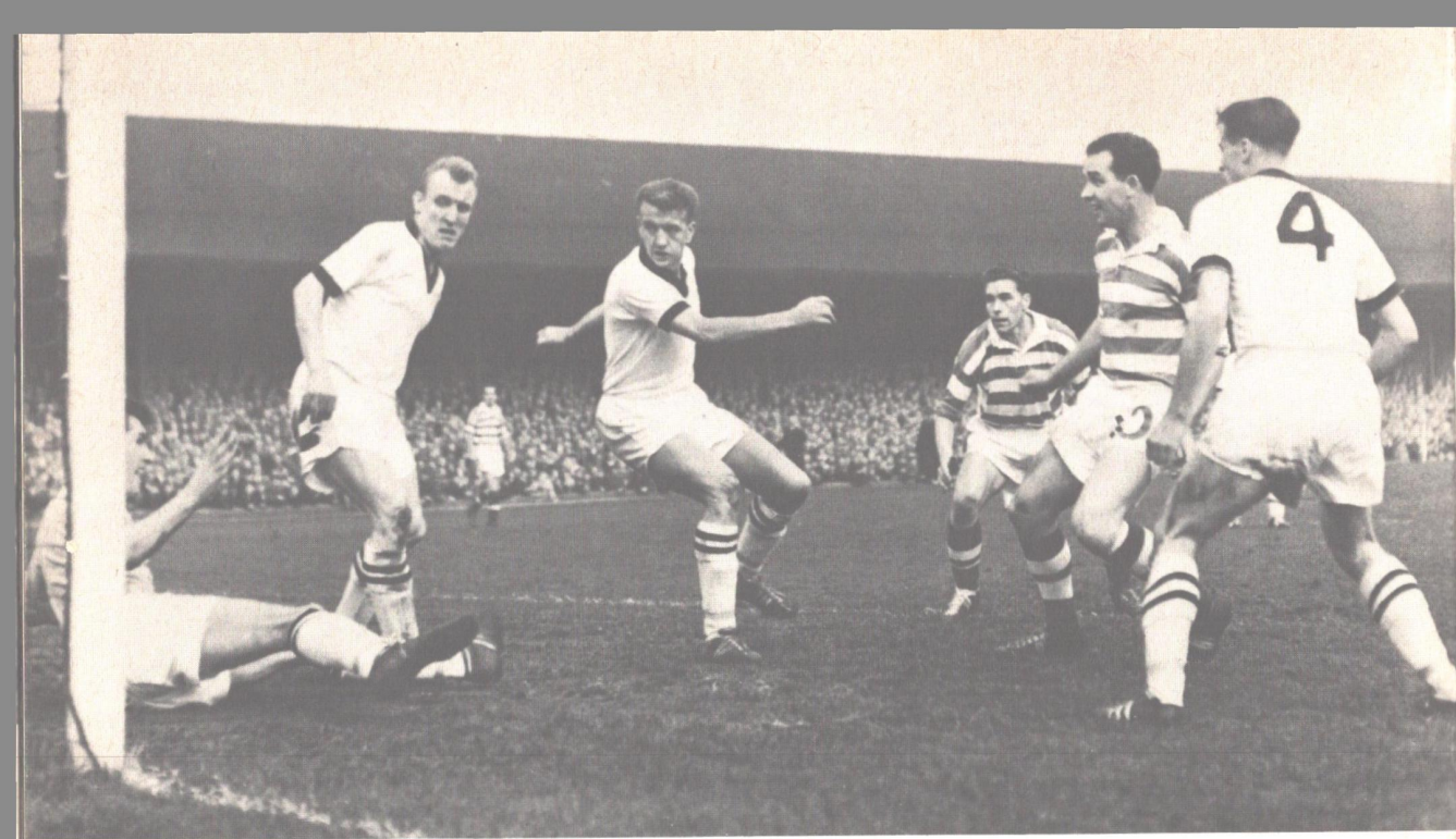
All the excitement in the St. Mirren goalmouth as Celtic storm into hectic attack