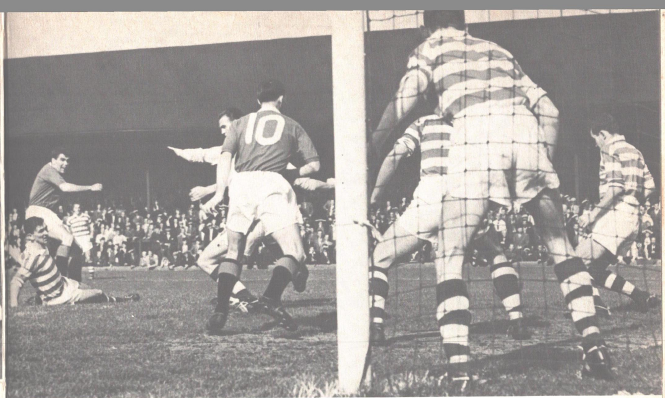
All the excitement in Celtic's goal this time as Rangers mount a hot raid