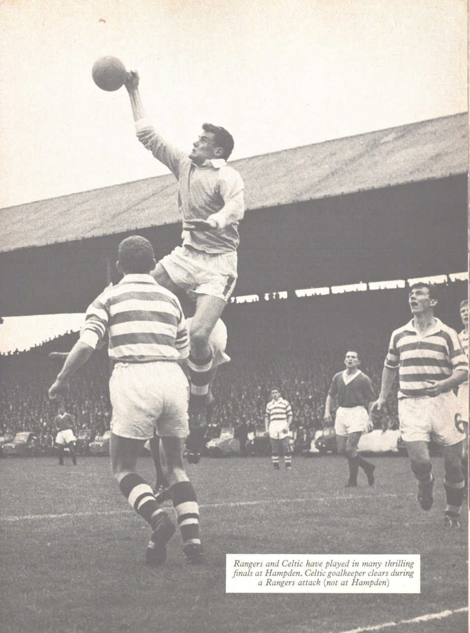
Rangers and Celtic have played in many thrilling finals at Hampden. Celtic goalkeeper clears during a Rangers attack (not at Hampden)