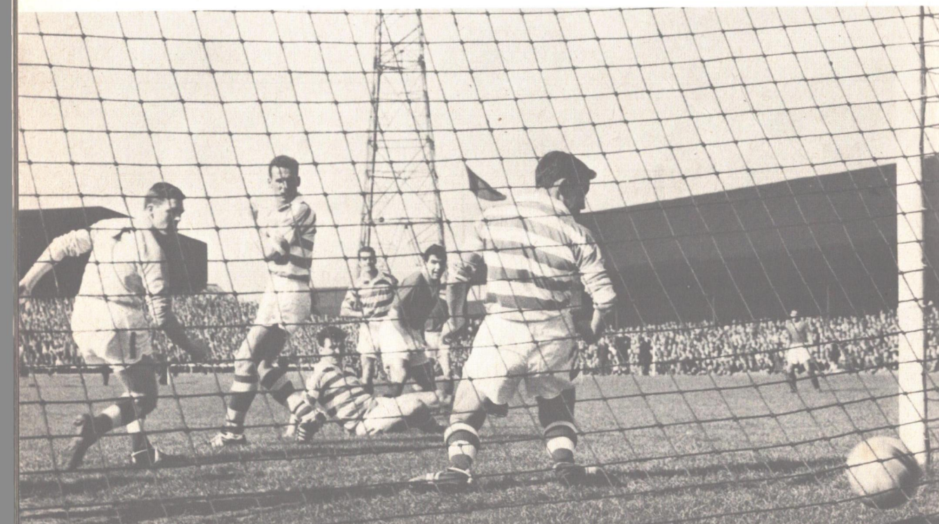
All the excitement as Scott, Rangers, beats the Celtic defence to score