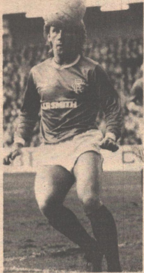
● IAIN FERGUSON . . . on target against Algeria

The line-up was: Bruce, MacFarlane, Miller, Dawson, Johnstone, MacKinnon, McMinn, Fleck, I. Ferguson, Redford, MacDonald. Subs: Nisbet (for Fleck 70 min) and Yule (for McMinn 83).