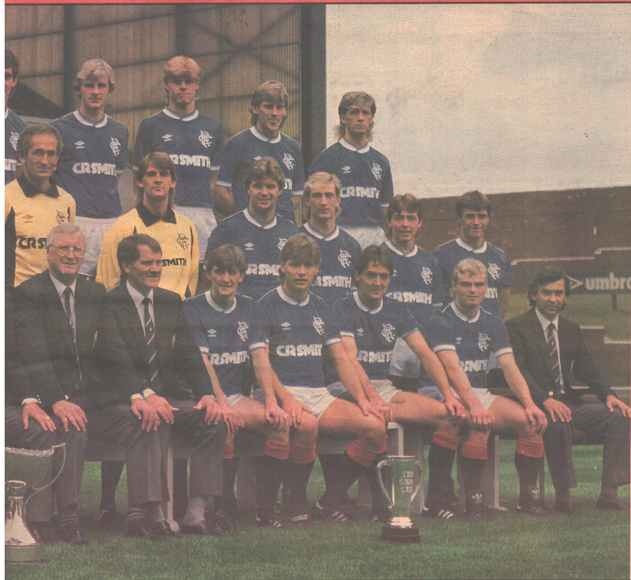
tz, Ian Durrant, Cammy y Bruce, Peter McCloy, stone, Hugh Burns, Billy Anderson (Youth Team Iain Ferguson, Bobby