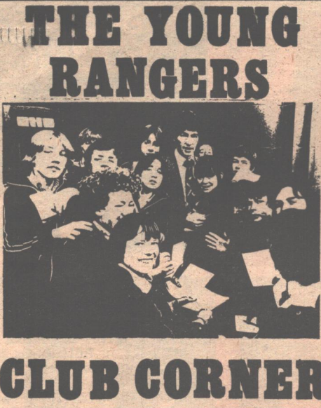
THE YOUNG RANGERS CLUB CORNER