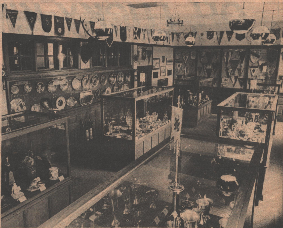
• It is well-known that the close season saw a lot of activity on the Rangers' pitch as a new drainage system and a new surface was put on the park.

"It was good to get one in the net. Let's hope there are a few more of them in the near future."