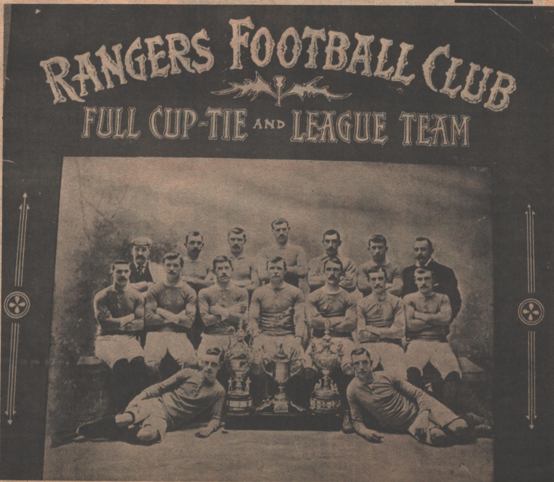
• Twelve moustaches . . . fourteen blue jerseys . . . three trophies . . . and what have you got? Rangers 1896 style! See story left.