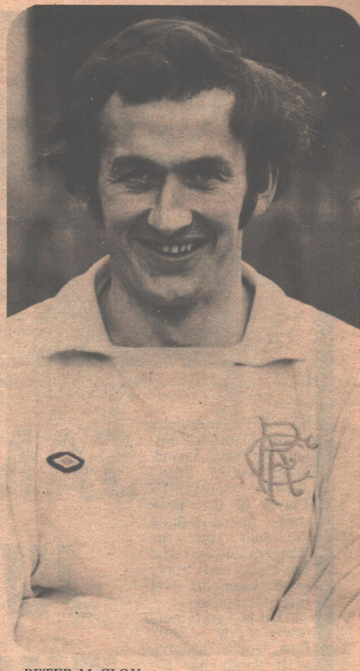
• PETER McCLOY . . . in terrific form on Rangers' world tour.

And what is certainly for the best is the undeniable fact that with Peter showing such great first-team form, it gives Rangers a goalkeeping depth that must be the envy of every side.