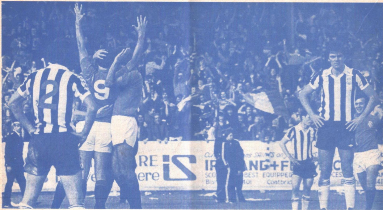
• A photograph which sums up the contrast in emotions after a goal has been scored. Gordon Smith and Davie Cooper want to be the first to congratulate Derek Johnstone on heading Rangers third goal, while John Young and Jackie Copland can only stare in disbelief and disappointment.