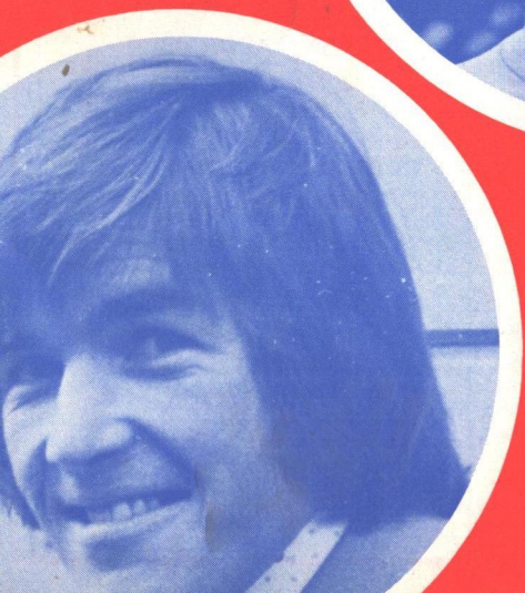
★ KENNY DALGLISH