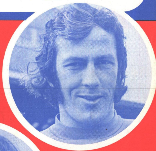
★ COLIN JACKSON